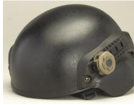
Helmet not included